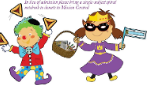
Illustration by: [illegible] for [illegible] with [illegible] at [illegible]

In lieu of admission please bring a simple subject of your choice to donate to Mission Central