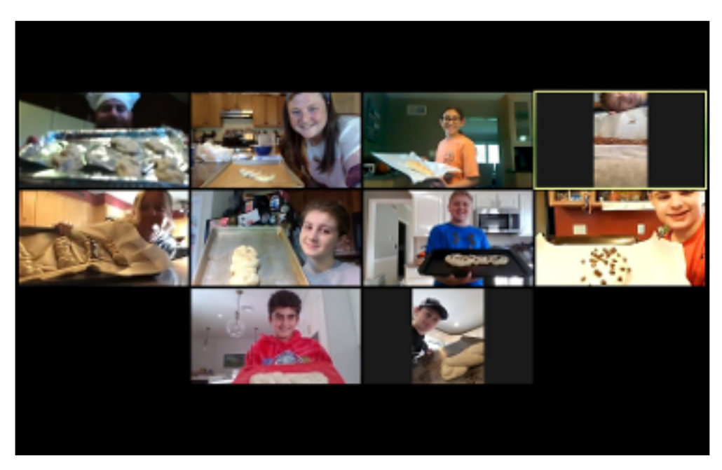
The 7th Grade Religious School class bakes Challah via Zoom.