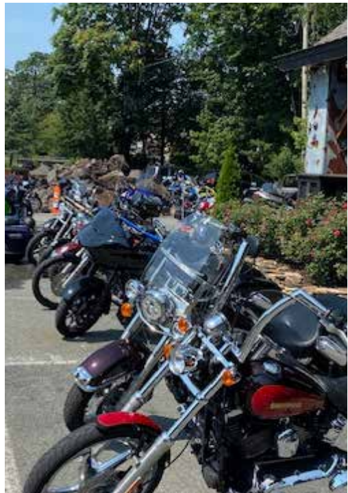
Last month, JMA rode along Route 443 all the way to Parryville near Jim Thorpe to the Riverwalck Saloon. Eleven riders joined for the trip on a beautiful day.