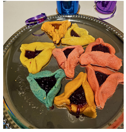
BETTER TOGETHER-HAMANTASCHEN BAKING