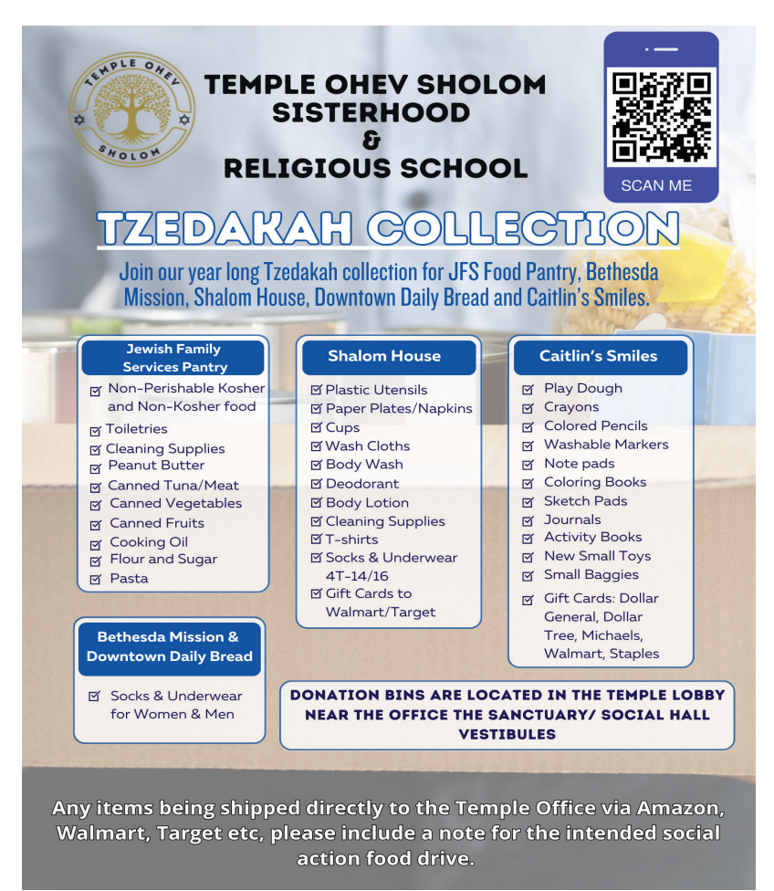
Thank you from The Sisterhood Social Action Committee and the Religious School

On behalf of the Temple Ohev Sholom Sisterhood Social Action Committee and the Religious School, we would like to extend our heartfelt gratitude and thank you to our members, students and parents who provided such kind donations during the Sisterhood and Religious School food drive. Your generous donations benefited Jewish Family Service, Sholom House, and Bethesda Mission. The donations will help to strengthen Temple Ohev Sholom's partnership with these organizations in our community and collectively aim to help eliminate food insecurities for families in crisis.